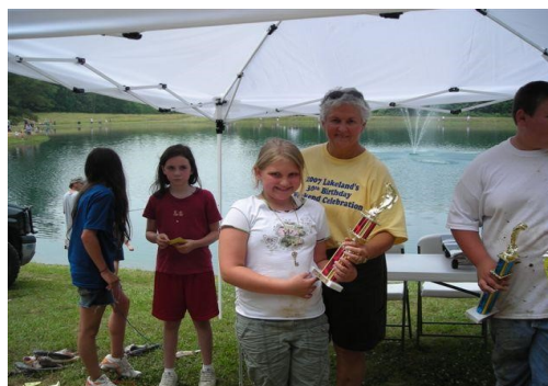
Lakeland Youth Fishing Rodeo

* All Meetings take place in the City Board Room at 10001 US HWY 70. Times and dates are subject to change, please call City Hall or check our website for confirmation or changes.