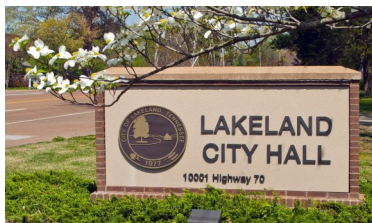
Lakeland City Hall