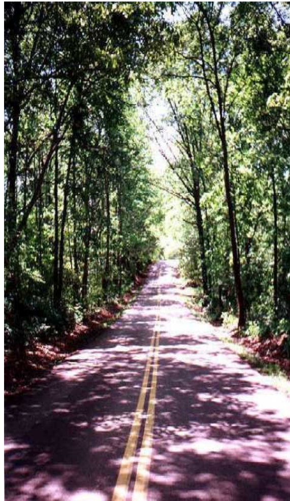
Scenic Corridor—Memphis-Arlington Road