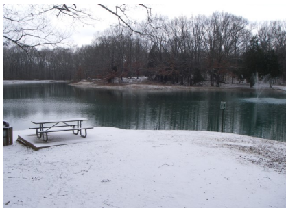
IH Park (4523 Canada Road) in the winter time

The City incorporated in 1977, formed its own school system in 2014, and operates under a City Manager form of government with a mayor and five commissioners. Lakeland is all about quality and has BIG dreams for its future.