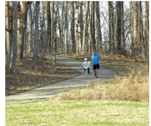
One of many trails open to the public in Lakeland